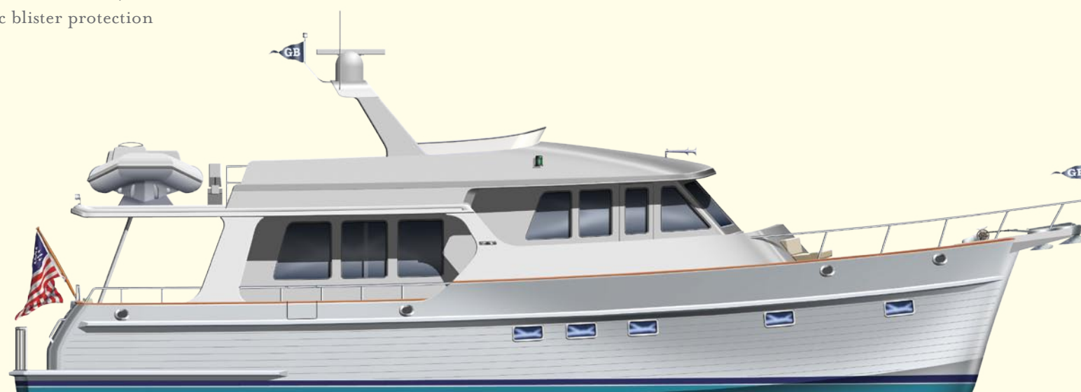
STANDARD LAYOUT UPPER DECK