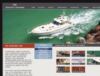
Image Gallery View beautiful wide-screen interior and exterior photos of all models.

Never has it been easier to learn more about your favorite Grand Banks yacht. Log on today to discover, investigate, compare, and download the information you need to make informed decisions. See how our boats are made, get specs on your favorite model, locate a dealer near you—all this and more is available at www.GrandBanks.com .