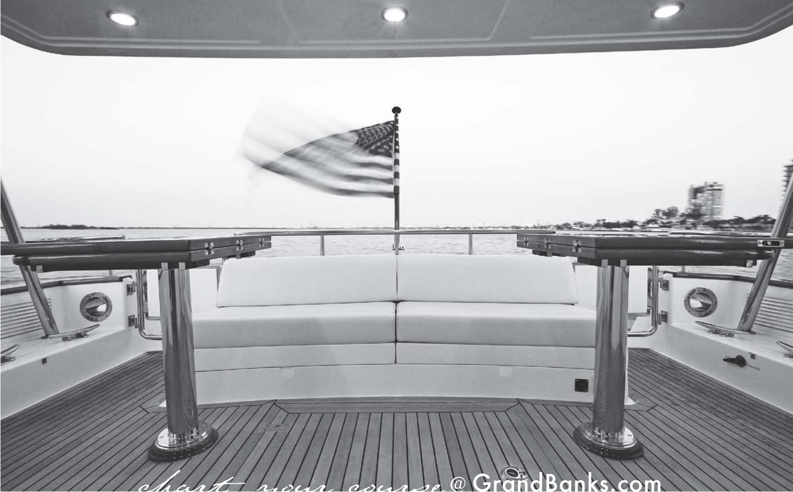
chart your course @ GrandBanks.com

Never has it been easier to learn more about your favorite Grand Banks yacht. Log on today to discover, investigate, compare, and download the information you need to make informed decisions. See how our boats are made, get specs on your favorite model, locate a dealer near you—all this and more is available at www.GrandBanks.com .