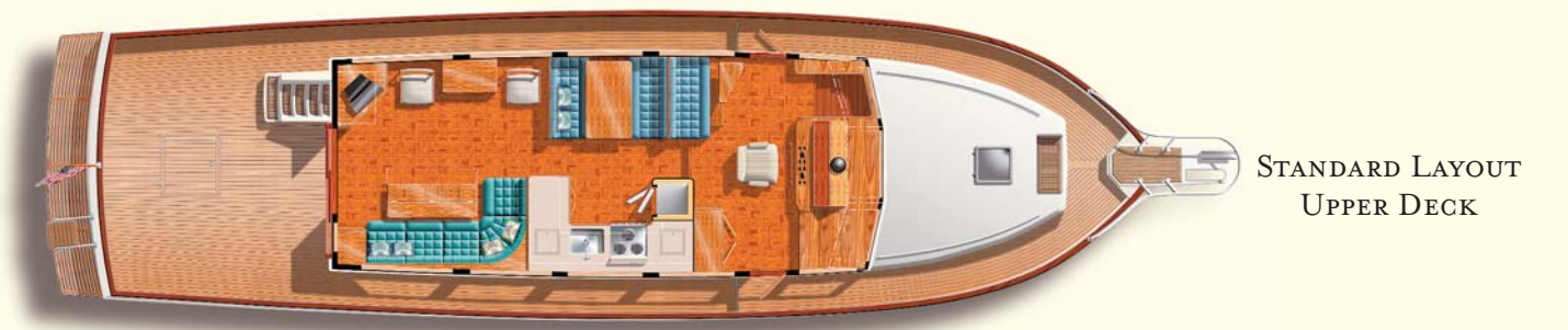
STANDARD LAYOUT UPPER DECK