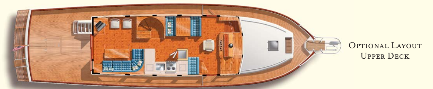
OPTIONAL LAYOUT UPPER DECK