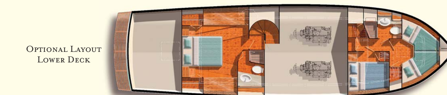
OPTIONAL LAYOUT LOWER DECK