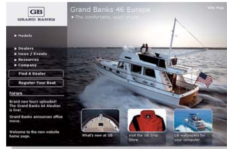
chart your course @ grandbanks.com

Never has it been easier to learn more about your favorite Grand Banks yacht. Log on today to uncover, investigate, scope out, and download the information you need to make informed decisions. From completely immersive 360-degree tours to downloadable engine performance curves, visit grandbanks.com to learn more.